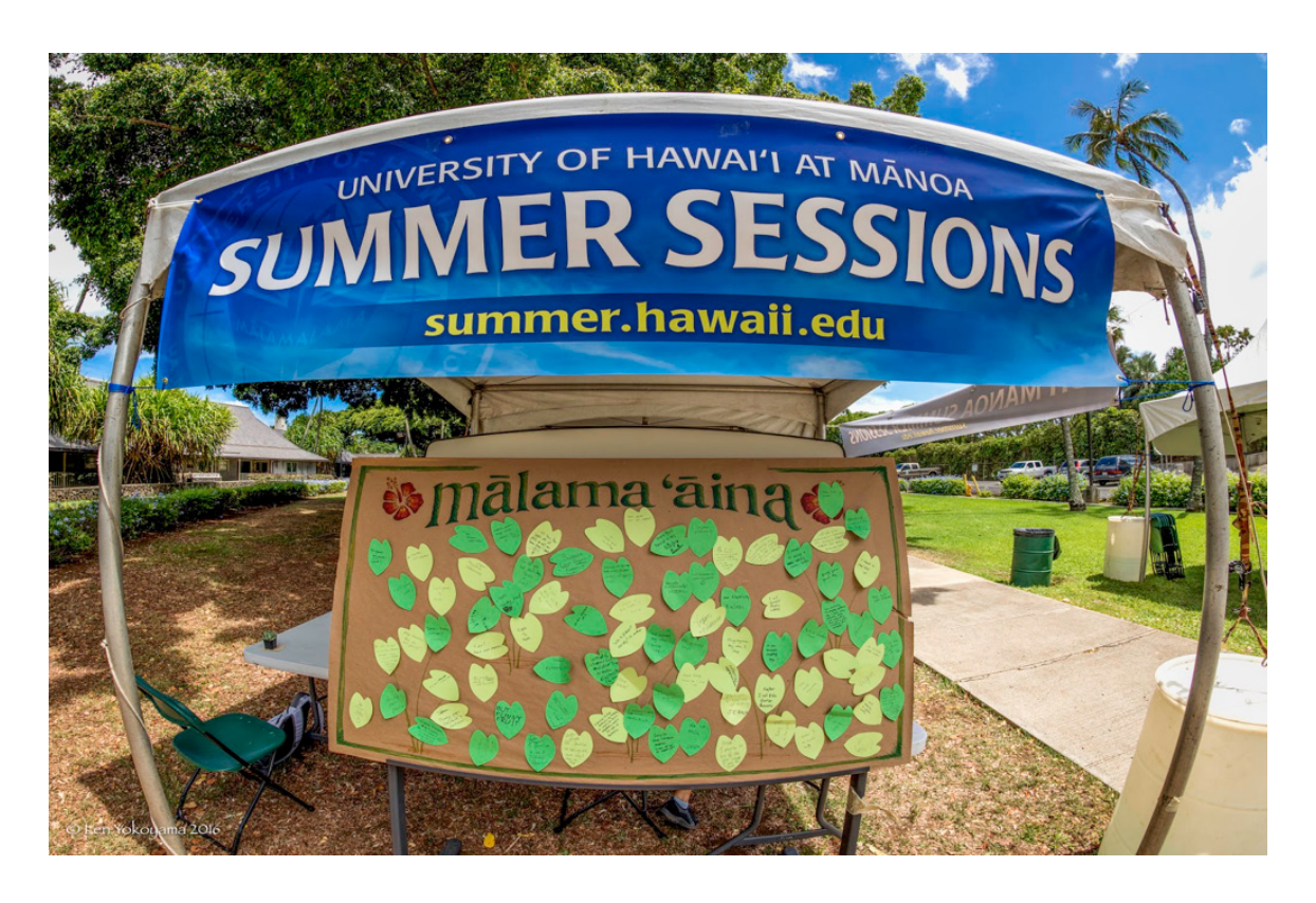
Figure 2: Commitment board