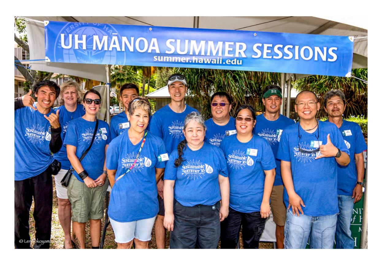
Figure 1: Sustainable Summer '16 T-shirts worn at Sustainable Summer Day