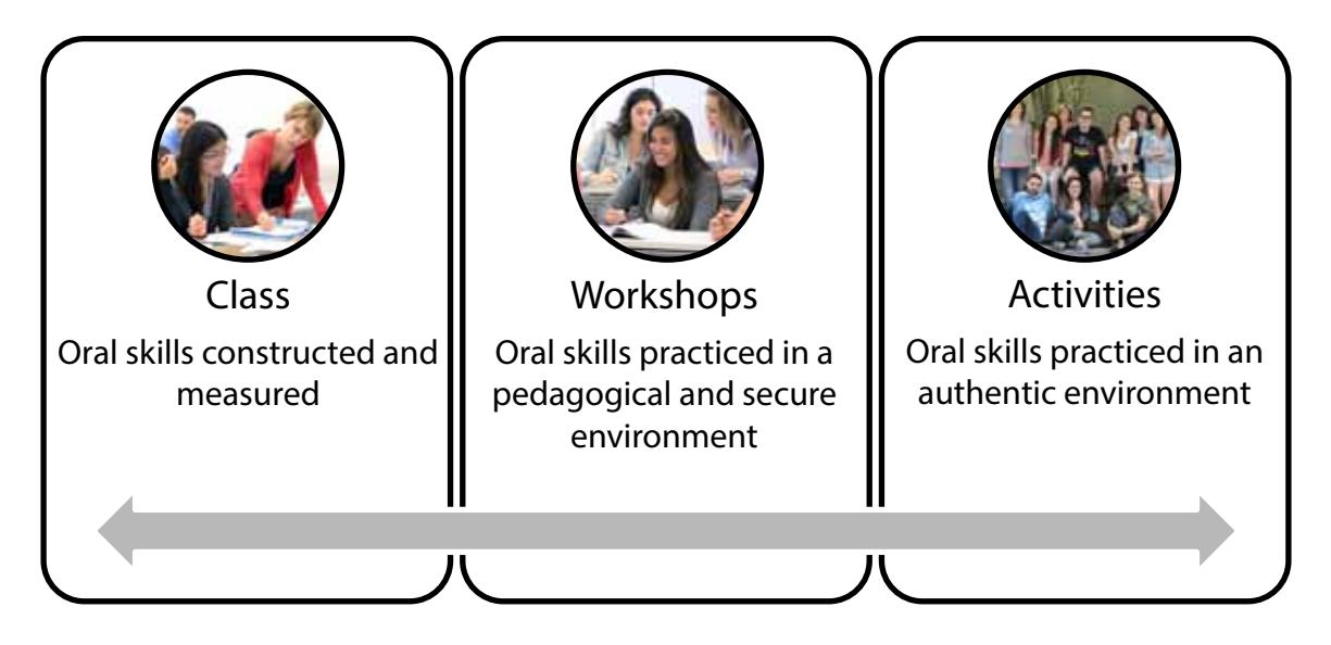
Figure 1: The Communicative Approach

Students are expected to complete a minimum of 50 hours of workshops and activities, in addition to the course itself. Their participation in this part of the program is an important element of the grading scheme of the course. On the first day of their stay, they receive a "passport" divided into 5 weeks. Each time they participate in an activity or a workshop, they get a stamp as proof of their presence and active participation. At the end of the 5-week stay, students receive points equivalent to the number of learning hours that have been accumulated outside of the classroom. These points are added to their final course grade.