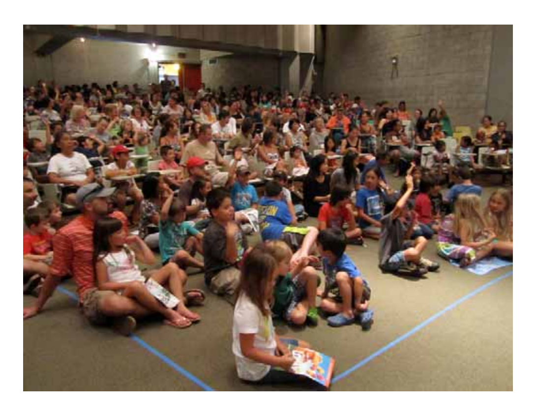
Figure 2. A Typical Screening at the UHM Kids First! Film Festival

The choice of dates will depend on the local community and campus facilities. UHM chose Sunday afternoons at 3:00 p.m., avoiding Saturdays filled with a plethora of family activities and taking advantage of free campus parking on Sundays. Films are scheduled on four or five Sundays, thereby avoiding conflicts with other summer session programs. Based on the state's public schools calendar, a couple of summer break weekends are allowed to pass before starting the festival; it is completed before August. No films are shown on Sundays when our city has scheduled major children's programs. Doors open half an hour before the event, which is generally completed by 5 p.m., in time for families to discuss the films over supper.