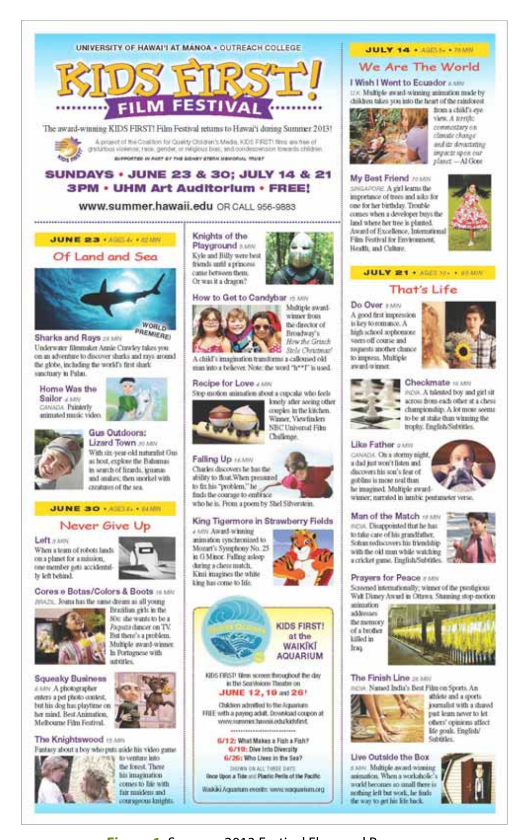
Figure 1. Summer 2013 Festival Flyer and Program